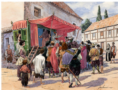
A Pageant Wagon

The stage for these plays was a two-story wagon called a “pageant wagon” – the lower floor serving as a curtained dressing room. Drawn by either men or horses, the pageant wagons wound their way through the old crooked streets to find a new audience eagerly awaiting them at each station, which might be a square or some well known spot such as the street in front of the Abby gate.