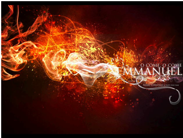
God has come again and pitched his tent with us.

”O Come, O Come, Emmanuel” is possibly the oldest Christmas carol still sung today. It dates back to the 9 th century and presents the biblical roles and prophecies that Jesus fulfilled. It crossed over from being a song only sung by professional singers in Latin to one that has been translated and sung popularly around the world.