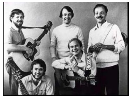
St Louis Jesuits

since 1993 he is a professor of liturgy, and the director of the Center for Liturgy at St Louis University. Among his better-known compositions are "One Bread, One Body" (1978), "Earthen Vessels" (1975), "Come to the Water" (1978), " The Cry of the Poor " (1978), "For You Are My God" (1970), and the album "As a River of Light" (1989).